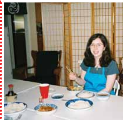
Miami of Ohio calls Meredith-san!